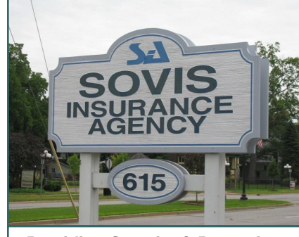
Providing Security & Protection Since 1945

Don't leave anything to chance. Protect the ones you love with Life Insurance.